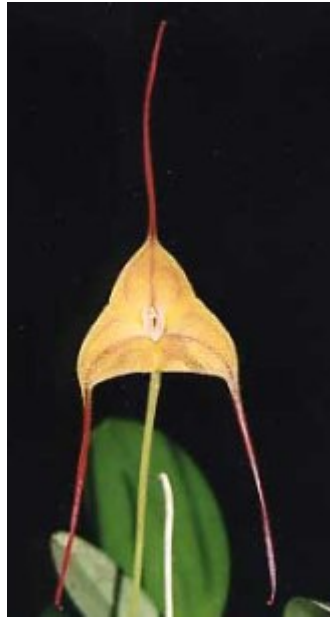
Masdevallia triangularis 'Sanborn'