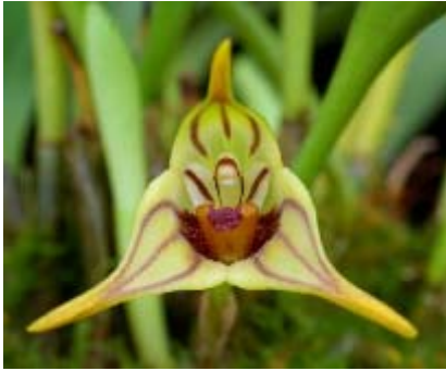
Masdevallia murex 'Bryon'