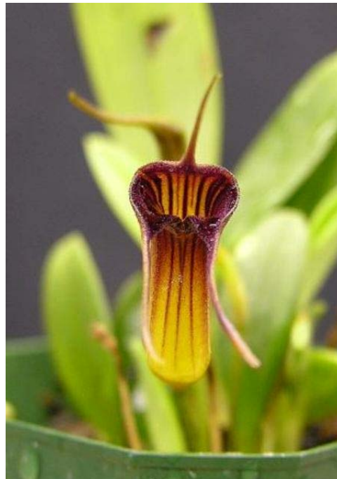
Masdevallia ventricularia (Colombia) Grown and Photographed by Bryon Rinke

Masdevallia ventricularia is native to northwestern Ecuador and Colombia. Ventriculus , in Latin means little belly, which appropriately describes an anterior bulging of the sepaline tube. This species is an intermediate to cool grower. The plant is small and produces small reddish brown flowers with reddish vertical stripes (Gerritsen & Parsons, 2005).