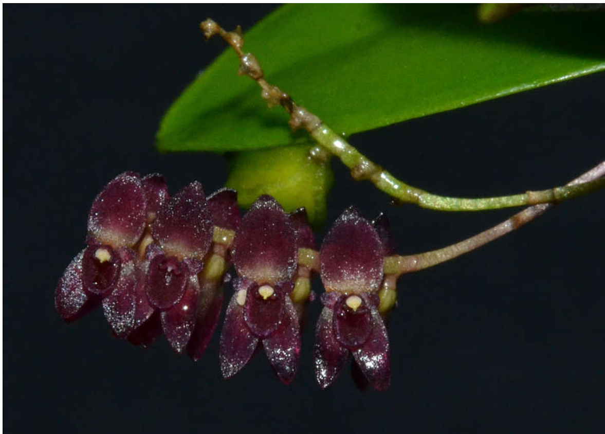
The above picture is Bryon's first species orchid that carries his name: Lepanthopsis rinkei Bryon CBR

I have had 7 species of orchids named after me.