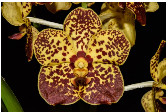
Vanda Kalapana Delight 'Sunrise'