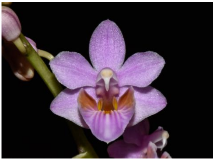
Phalaenopsis San Shia Appendo 'Bryon'