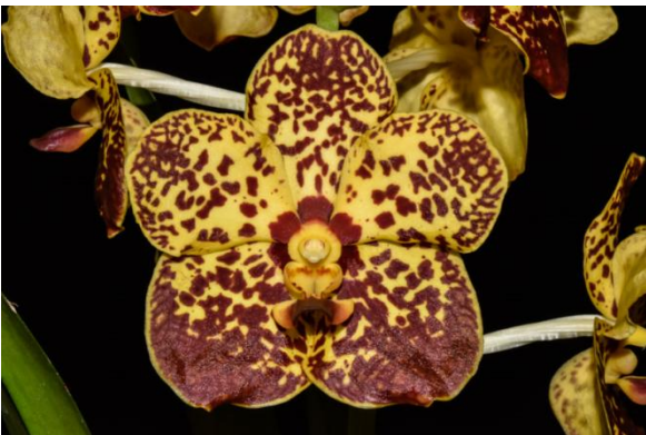
Vanda Kalapana Delight 'Sunrise'