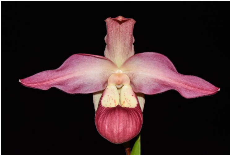
Phragmipedium Peruflora's Spirit 'Dorothy Mae' AM 80 pts.