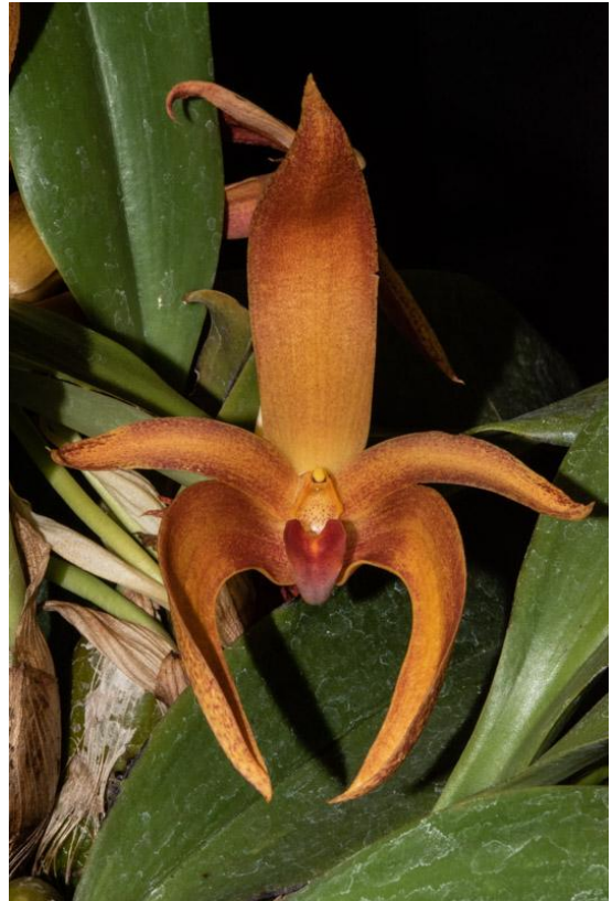
Bulbophyllum Agathe 'Max' HCC 79 pts.