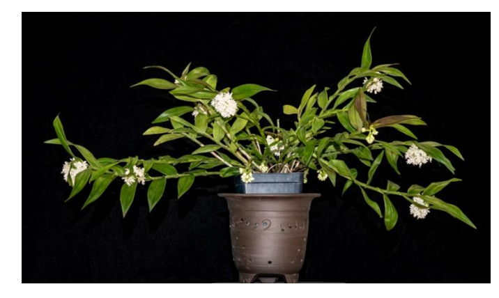
Epidendrum hugomedinae 'Bryon Rinke' CCE 90 pts. Exhibitor: Bryon Rinke