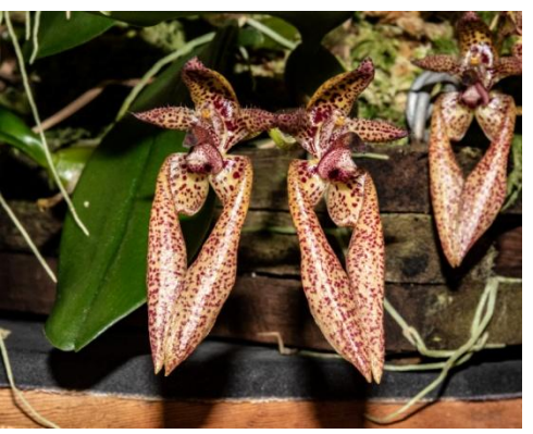
Bulbophyllum Meen Mercury Sandal 'Timbucktoo' AM 80 pts. Exhibitor: Sarah Pratt