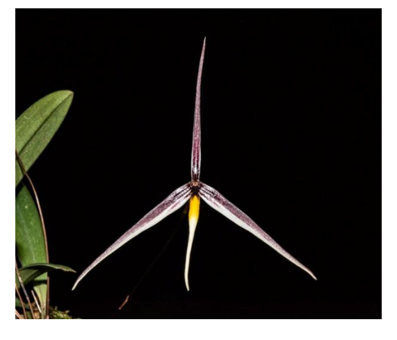
Bulbolphyllum speciosum 'Timbucktoo' AM 80 pts. Exhibitor: Sarah Pratt