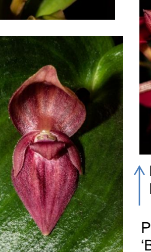
Epicattleya Veitchii 'Bryon' AM 80 pts. Exhibitor: Bryon Rinke