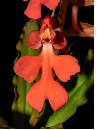
Habenaria rhodocheila subsp. rhodocheila 'Bryon's roebelenii'0 HCC 78 pts. Exhibitor: Bryon Rinke