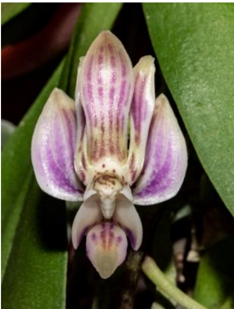
Phalaenopsis finleyi 'Bryon Rinke' HCC 78 pts. Exhibitor; Bryon Rinke