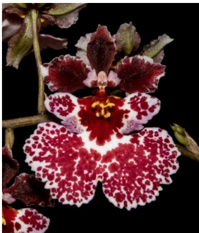
'B & M' HCC 77 PTS.