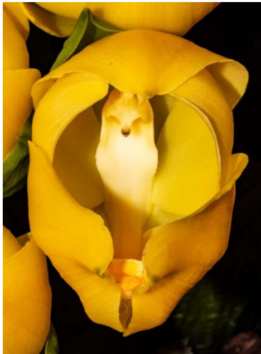
Anguloa clowesii 'Amsterdam' AM 81 pts. Exhibitor; Douglas Needham