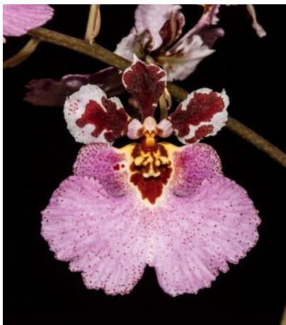
'M & B' HCC 78 pts.

EDITOR'S NOTE: Both of these plants are Rodrumnia Walnut Valley Cherry siblings (out of the same seed pod). The tolumnia group is noted for being variable and producing siblings that can be very different in color.