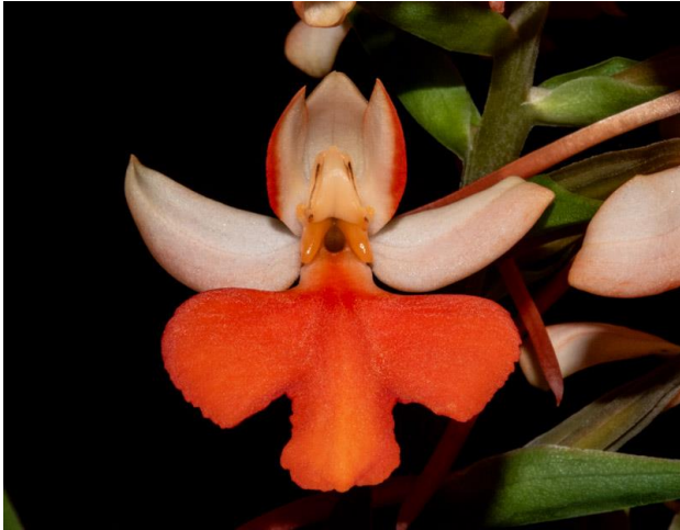
Pectabeneria Western Tanager , Bryon Rinke' AM 83 pts. Exhibitor: Bryon Rinke