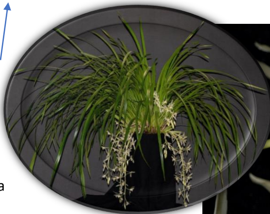
Cymbidium dayanum f. alba 'Timbucktoo' AM_81 pts. Exhibitor: Sarah Pratt