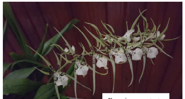
Brassia new start