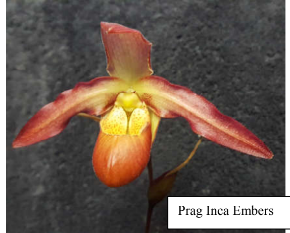
Prag Inca Embers