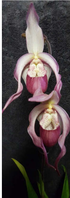
Prag shroderie Rosum