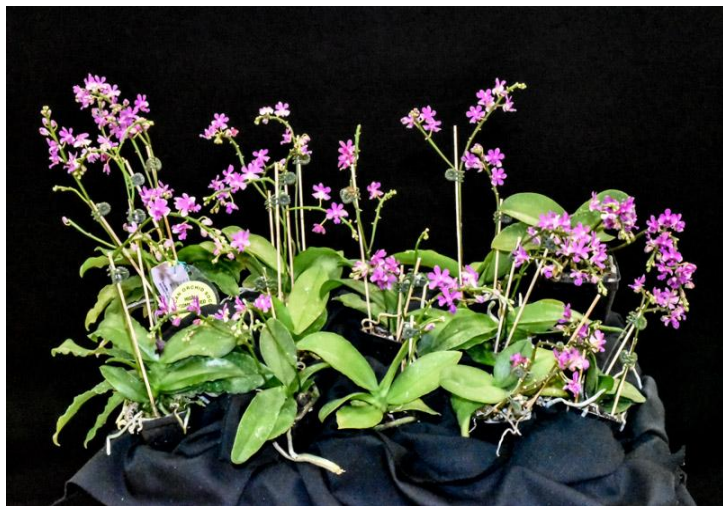
Phalaenopsis Forever Young

Awarded once to a cross exhibited by a single individual (usually the breeder) as a group of not less than 12 plants or inflorescences of different clones of a hybrid or cultivated species. At least one of the inflorescences must receive a flower quality award and the overall quality of the group must be an improvement over the former type.