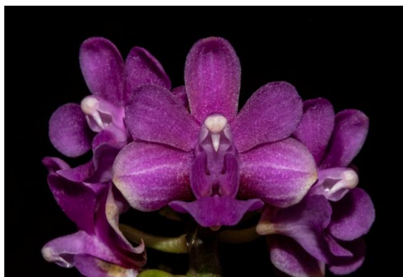
Phalaenopsis Forever Young 'B & M' AM 80 pts.

HCC: Highly Commended Certificate 75 -79 points