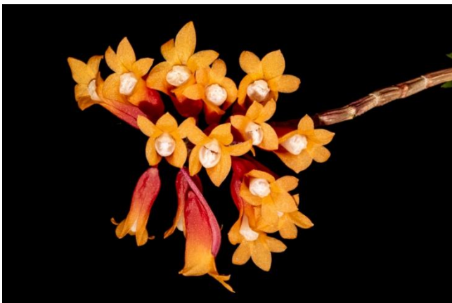
Dendrobium lawesii 'Bryon' HCC 79 pts.

Four tubular flowers and two buds on six inflorescences; sepals and petals red centrally, yellow distally; lip saccate, yellow overlaid red, brown stripes distal one-fifth, yellow picotee apical edge; column cream-colored, anther cap ivory; ovary red-pink, pubescent, 1.5cm long x 0.3cm wide; substance medium; texture crystalline.