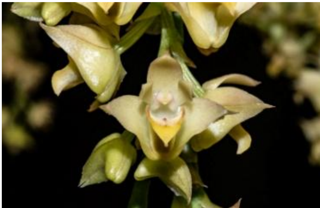
Polystachya cultriformis 'Vanderlip' CHM

‘Awarded to a well-grown and well-flowered species or natural hybrid with characteristics that contribute to the horticultural aspects of orchidology, such as aesthetic appeal. This award is granted provisionally and filed with the judging center Chair pending taxonomic verification supplied by the exhibitor.’ AOS judging handbook .