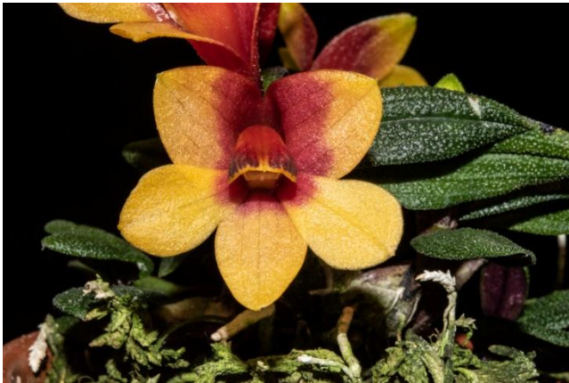
Dendrobium Aussie Hi-Lo 'M & B' HCC 79 pts

HCC: Highly Commended Certificate 75 -79 points