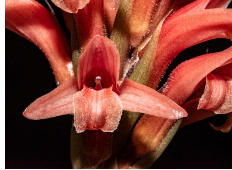
Paphiopedilum rothschildianum 'Max & Bryon's Best' FCC 91 pts.