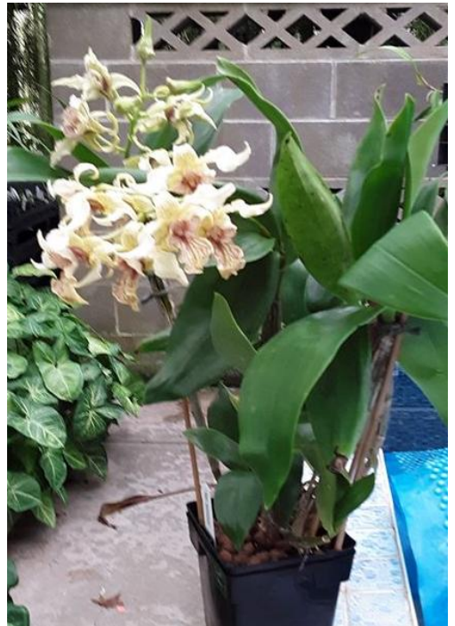
Dendrobium Cassowar (Den. eximium x Den. spectabile)

A preview of a few of the plants that will be on the auction block to go home with a lucky bidder.