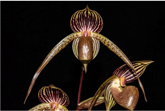
Paph. Hsinying Lady Duck 'Max' AM 83 pts. Exhibitor: Max Thompson