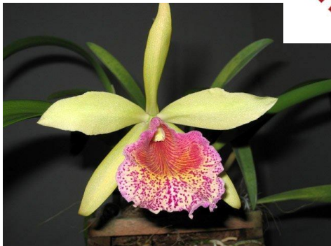
Bc. Keowee 'Newberry'