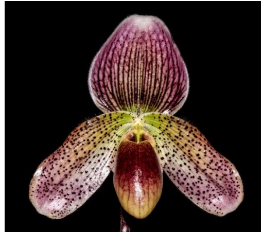
Paph. Conco-Callosum 'Max' AM 81 pts. Exhibitor: Max Thompson