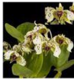
Bulbophyllum comosum "Whisper Morning Has Broken" CBR/AOS