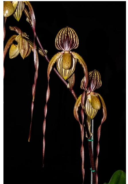
Paphiopedilum Philip's Song 'Luka' AM/81 pts. Exhibitor: Lois Green