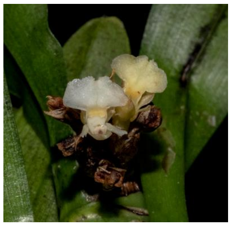
Agrostophyllum planicaule 'Bryon' CBR Exhibitor: Bryon Rinke