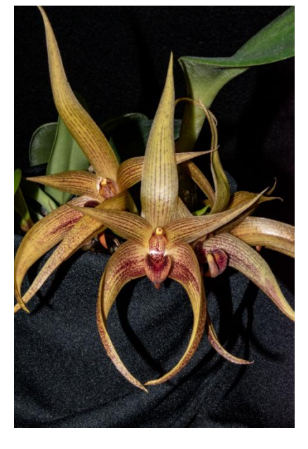
Bulbophylllum Walnut Valley Star 'Max & Bryon' AM 84 Exhibitors: Max Thompson and Bryon Rinke