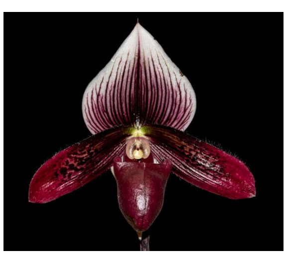
Paphiopeilum Laura's Sixtieth 'Slipper Zone Wayne' AM 82 Exhibitor: Graham Wood, Lehua Orchids