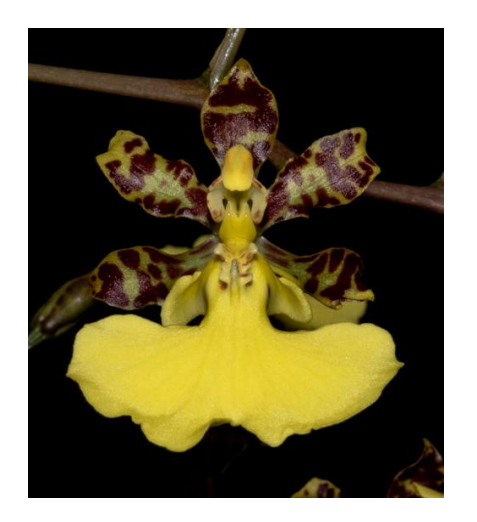
Trichocentrum Comete ,Bryon' AM 83 pts Exhibitor: Bryon Rinke