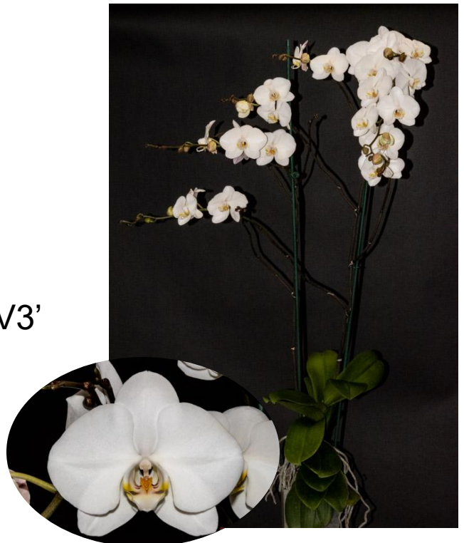
Phalaenopsis White Dream 'V3' CCM 83 pts. Exhibitor: Douglas C. Needham