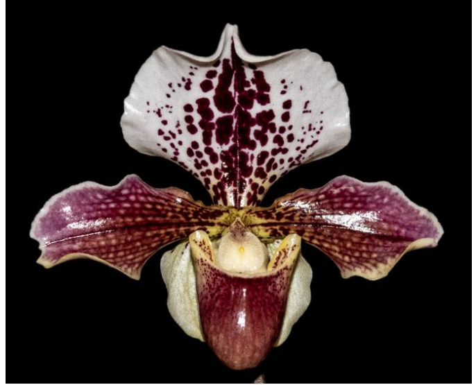
Paphiopedilum Beyond Pink 'Bryon' HCC 75 pts Exhibitor; Bryon Rinke