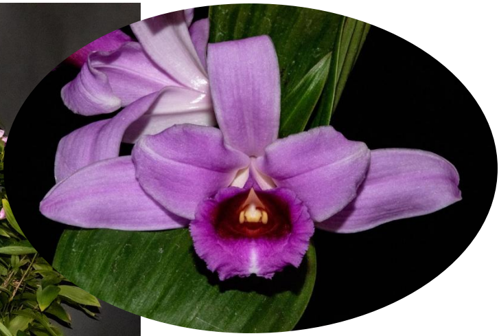
Sobralia sessilis 'Winfield' CBR