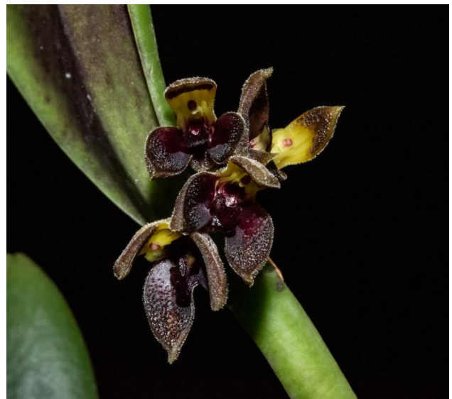
Acianthera apthosa 'Bryon Rinke' CHM 82 pts.