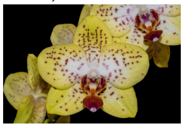
Phal. Walnut Valley Yellow Sun 'Max & Bryon' AM 80 pts. Exhibitors: Max Thompson and Bryon Rinke