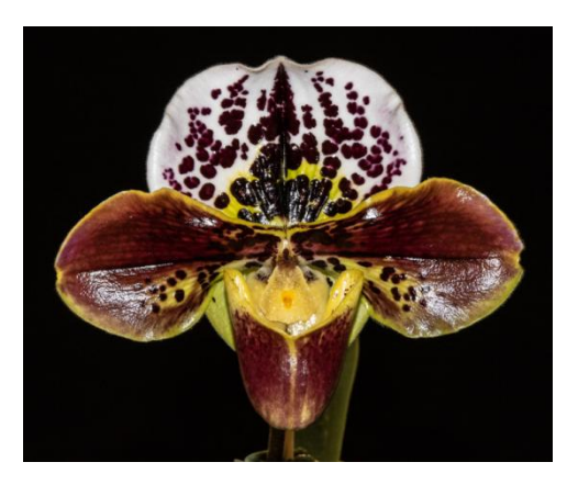
Paph. Walnut Valley Spots 'Max' AM 87 pts. Exhibitor Max Thompson