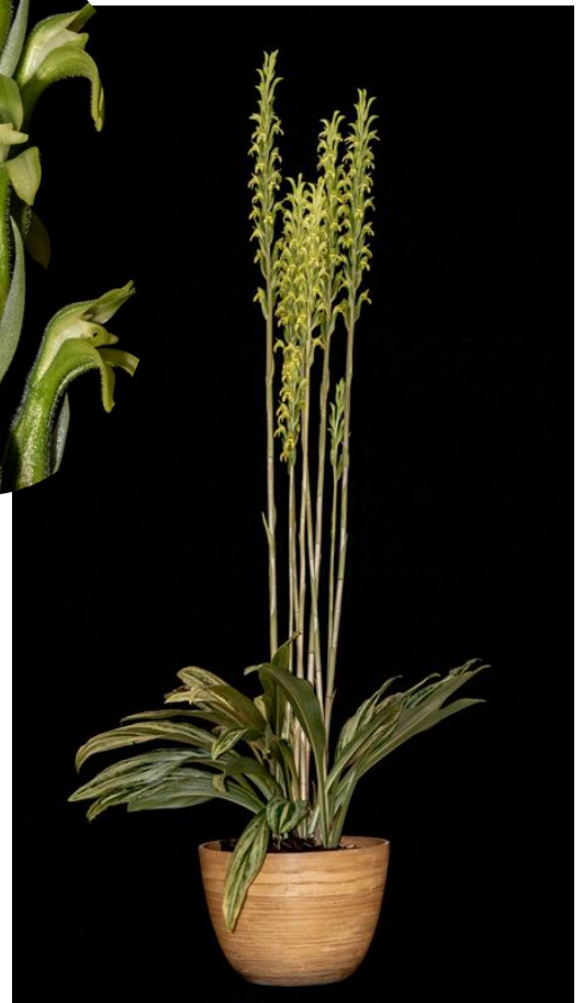
Sarcolexia Sea Foam 'Bryon' CCE 93 pts. Exhibitor: Bryon Rinke