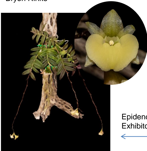
Epidendrum prostratum 'Bryon' CCM 86 pts & AM 80 pts. Exhibitor: Bryon Rinke