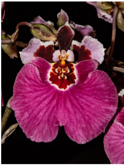
Rodrumnia Walnut Valley Cherry 'M & B Big Pink' AM 80 pts. Exhibitors: Max Thompson and Bryon Rinke