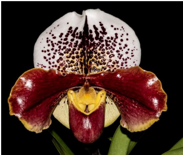
Paphiopedilum Jersey Sunset 'Big Ben' AM 83 pts. Exhibitor: Douglas Needham