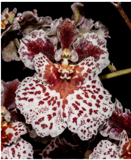
Tolumnia Walnut Valley Queen 'M & B Spotty' AM 81 pts. Exhibitors: Max Thompson and Bryon Rinke