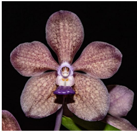
Vanchoanthe Rainbow Prism 'Velvet's Purple Ribbon' HCC 77 pts. Exhibitor: Susan Tompkins