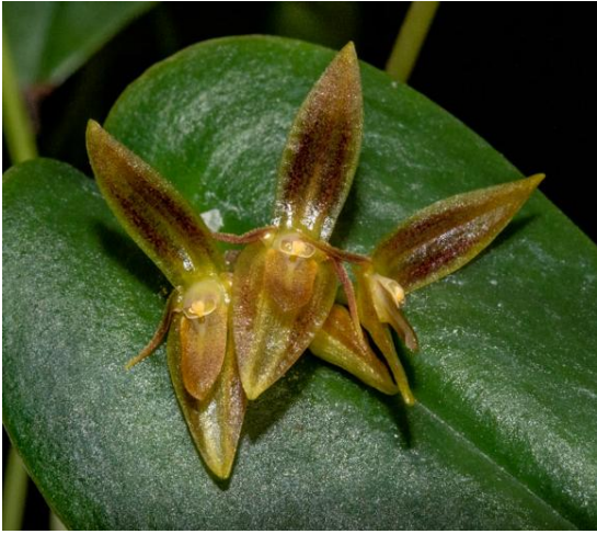
Pleurothallis (Acronia) coriacardia 'Bryon' CBR