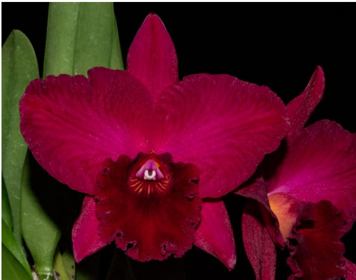
Rhyncattleanthe Magenta Sunset 'Max & Bryon' AM 81 pts.